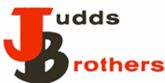
Construction Golf Ball Sponsor