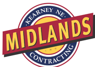
Beverage/Snack Cart Sponsor