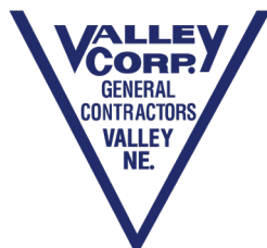
Great White Course Cart Sponsor