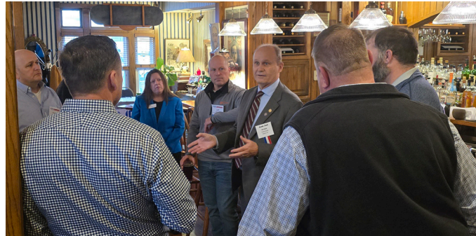
Members meet regularly with federal and state lawmakers, including during the NUCA Washington Summit and Legislative Networking Reception with State Senators respectively.