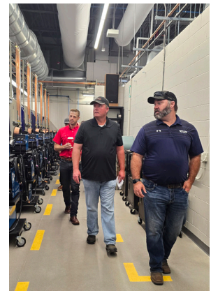
Members benefit from safety and career training opportunities, and engage in workforce development and recruitment events, include Dozer Day.